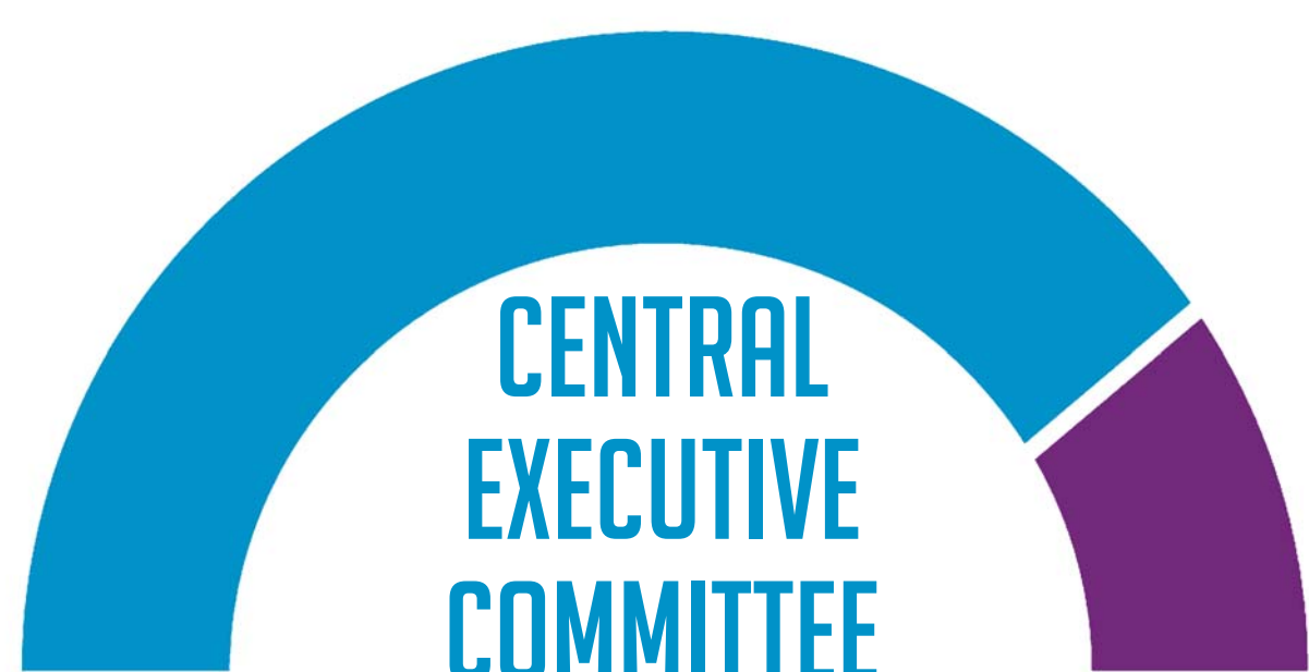
CENTRAL EXECUTIVE COMMITTEE