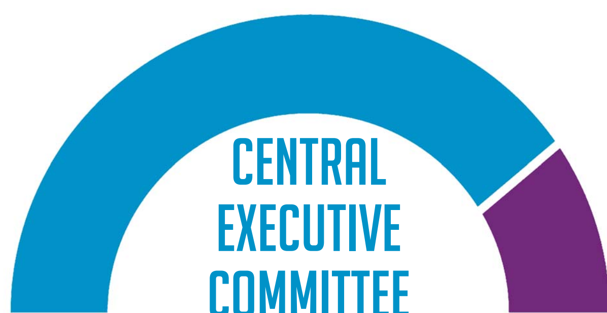
CENTRAL EXECUTIVE COMMITTEE OFFICERS