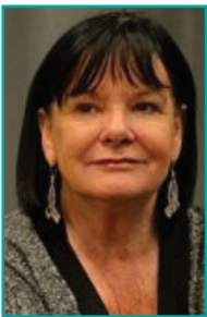
SHARON BURROW General Secretary, ITUC

Sharon was elected General Secretary of the ITUC at its Second World Congress in Vancouver, June 2010. Prior to this, she held the position of ITUC President since its Founding Congress in Vienna (November 2006) and the position of ICFTU President since its 18th World Congress in Miyazaki (November 2004).