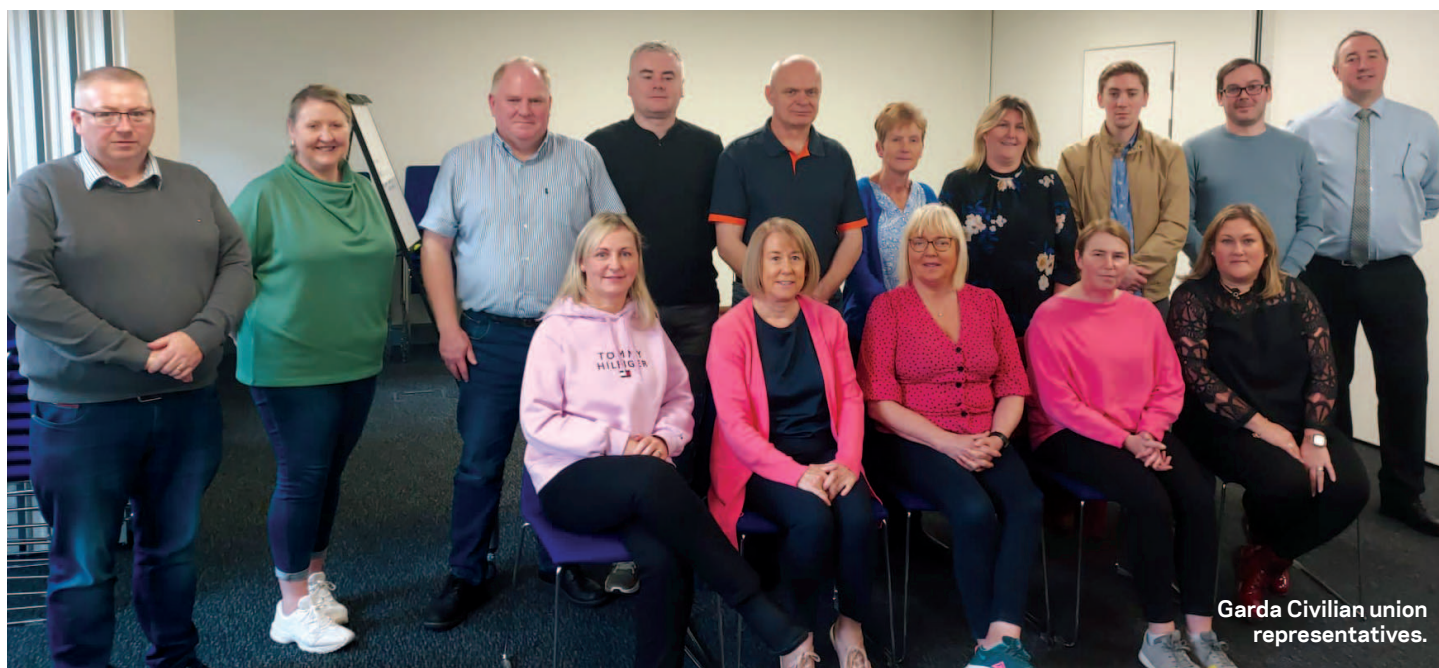
Garda Civilian union representatives.

The potential implications of the proposed Policing, Security and Community Safety Bill continue to be a top priority for Fórsa members working in the Garda area. This article provides an update on the current status of the Bill and how your union is fighting for you.