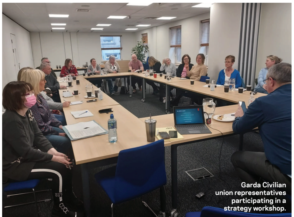
Garda Civilian union representatives participating in a strategy workshop.

As this campaign progresses, we will be communicating further updates to all members. If you would like to get involved with this project or would like further information, please contact your local Fórsa representative (details on page 3) or email gardacivilianinfo@forsa.ie .